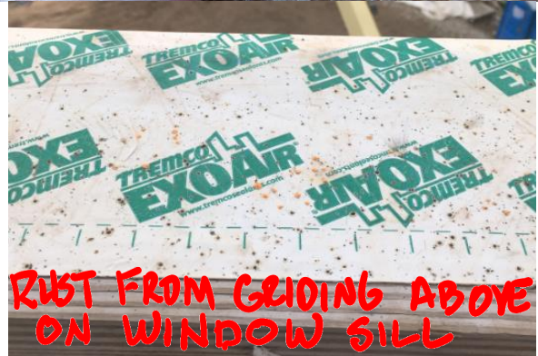
RUST FROM GRINDING ABOVE ON WINDOW SILL